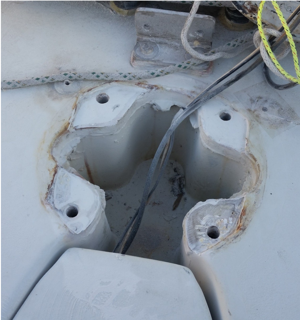
Deck Well from below.